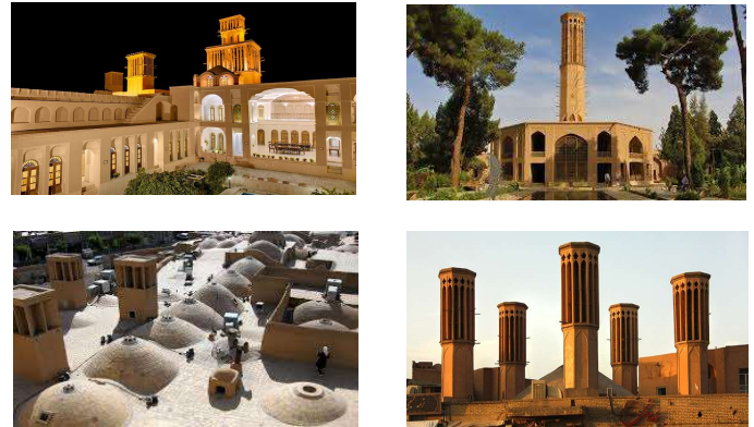
Figure 2: Different type of wind catchers 2,11,12